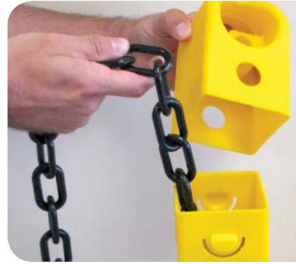
Guard Post is available now from Sentry Protection Products and its many authorized distributors.